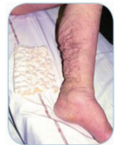
Before → 5 days → After

MOBIDERM® , applied under a Thuasne reducing bandage , leads to a rapid improvement in skin suppleness and reduces œdema . It saves time for both patients and practitioners, facilitates out-patient treatment , improves patients' compliance with their treatment , gives them greater autonomy and enhances their quality of life .